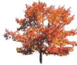
Northern Red Oak