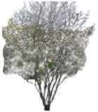
Shadblow- Multi Stem